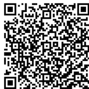
DRURY INN HOTEL

SCAN QR FOR KRANZBERG ARTS FOUNDATION DISCOUNT RATE AT ANGAD ARTS HOTEL.